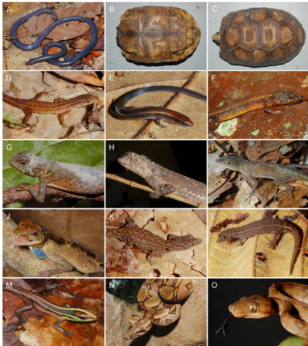
Figure 4. Photos of some of the species found in the Floresta Nacional de Pau-Rosa, municipality of Maués, state of Amazonas, Brazil. (A) Caecilia gracilis , (B) Chelonoidis denticulata in ventral view, (C) Chelonoidis denticulata in dorsal view, (D) Cercosaura sp. (E) Iphisa elegans , (F) Loxopholis osvaldoi , (G) Plica umbra , (H) Uranoscodon superciliosus , (I) Norops fuscoauratus , (J) Norops tandai , (K) Gonatodes humeralis , (L) Lepidoblepharis heyerorum , (M) Kentropyx calcarata , (N) Boa constrictor , (O) Corallus hortulanus . This figure is in color in the electronic version.