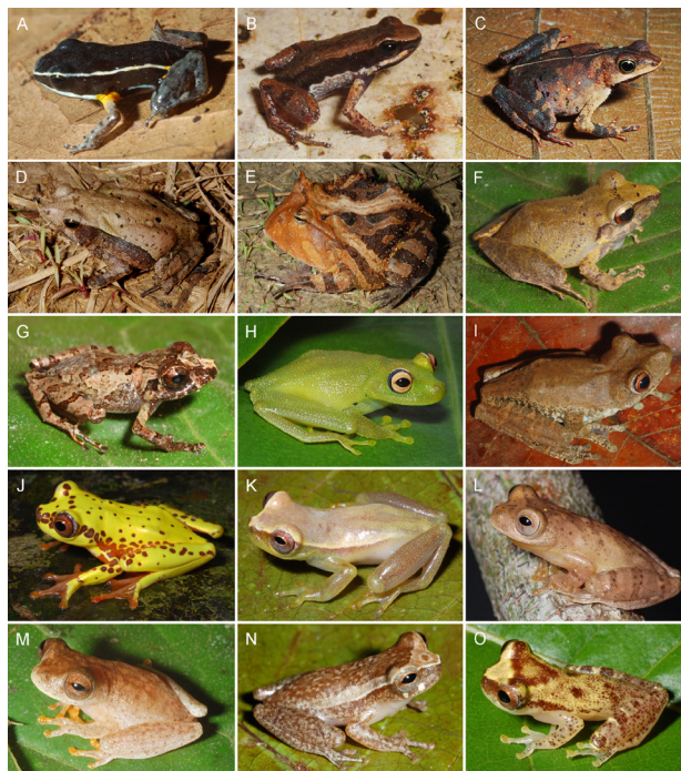
Figure 2. Photos of some of the species found in the Floresta Nacional de Pau-Rosa, municipality of Maués, state of Amazonas, Brazil. (A) Allobates femoralis , (B) Allobates masniger , (C) Amazophrynella bokermanni , (D) Rhinella gr. margaritifera , (E) Ceratophrys cornuta , (F) Pristimantis fenestratus , (G) Pristimantis sp. 1, (H), Boana cinerascens , (I), Boana wavrini , (J) Dendropsophus mapinguari , (K) Dendropsophus minusculus , (L) Dendropsophus minutus , (M) Dendropsophus ozzyi , (N) Dendropsophus schubarti , (O) Dendropsophus sp. 1. This figure is in color in the electronic version.