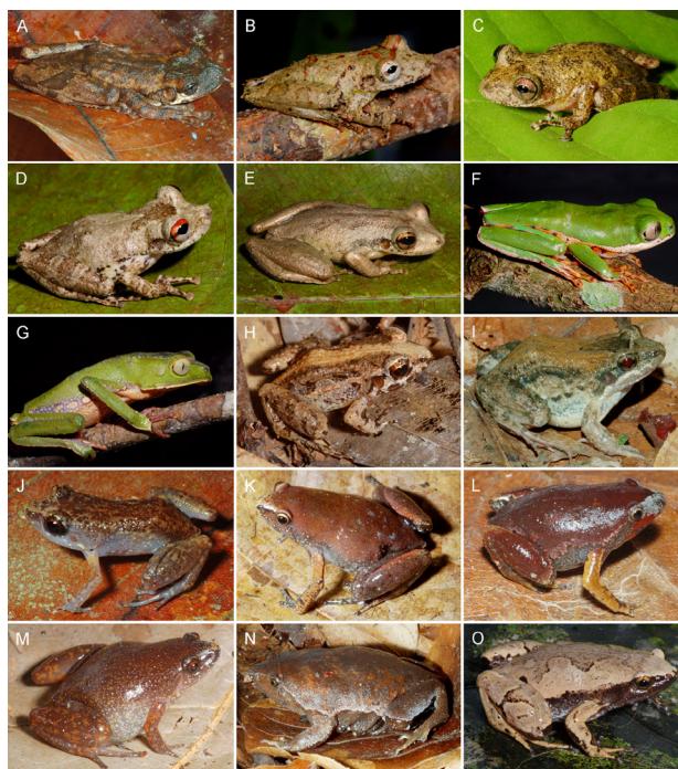
Figure 3. Photos of some of the species found in the Floresta Nacional de Pau-Rosa, municipality of Maués, state of Amazonas, Brazil. (A) Osteocephalus taurinus , (B) Scinax garbei , (C) Scinax sateremawe , (D) Scinax sp. 1, (E), Scinax sp. 2, (F) Phyllomedusa vaillanti , (G) Pithecopus hypochondrialis , (H) Adenomera sp. 1, (I) Leptodactylus petersii , (J) Phyzelaphryne miriamae , (K) Chiasmocleis avilapiresae , (L) Chiasmocleis bassleri , (M) Chiasmocleis hudsoni , (N) Ctenophryne geayi , (O) Hamptophryne boliviana . This figure is in color in the electronic version.